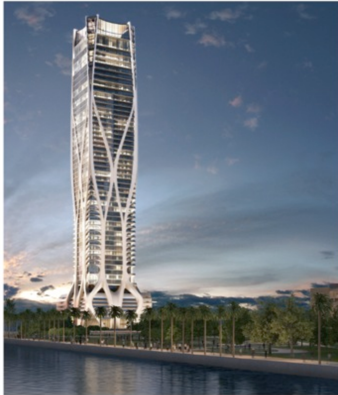
Exterior of One Thousand Museum. Rendering: Zaha Hadid Architects