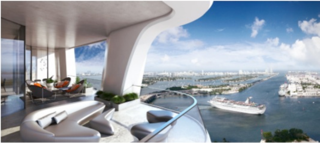
One Thousand Museum Penthouse. Rendering: Zaha Hadid Architects

The Bath Club Estates: Soon, a new 18-story condominium complex will grace Miami Beach's waterfront—the brainchild of developer Peebles Corporation and a variety of accomplished architects. The building is ultra-exclusive with only 13 residential units: one triplex penthouse, two duplex villas, and ten one-floor estates. Construction will commence in January 2015, and the building should be finished by mid 2016.