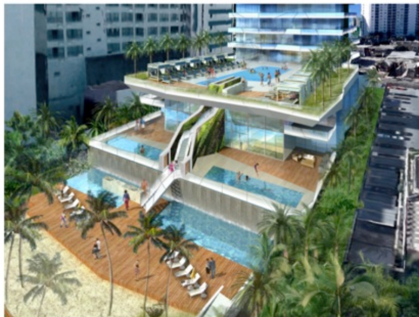
Pools at The Bath Club Estates. Rendering: The Bath Club Estates