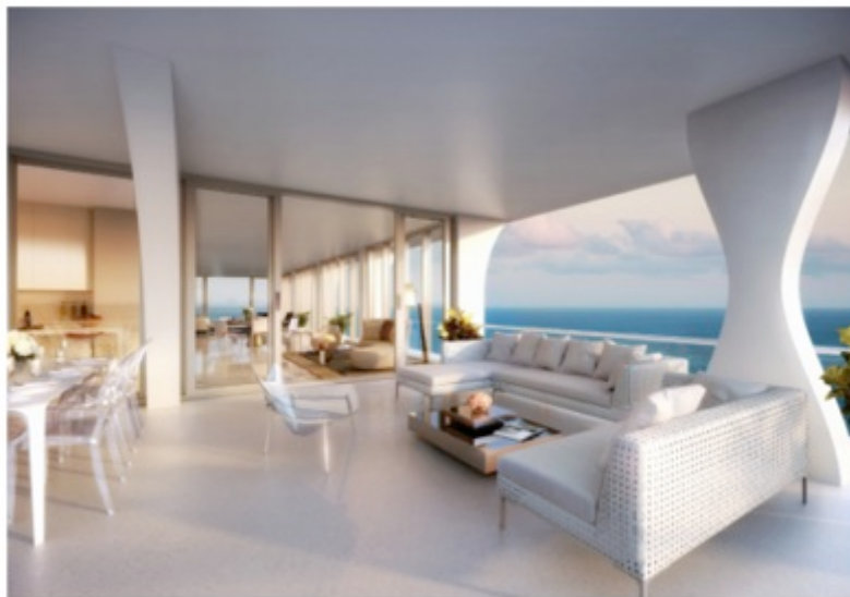
Penthouse at the Jade Signature. Rendering: Jade Signature

One Thousand Museum: Famed architect Zaha Hadid is bringing a new level of luxury to downtown Miami. Construction is already underway for One Thousand Museum , which has an estimated completion date in late 2016. At 62 stories with 83 units, this project marks her first skyscraper in the Western Hemisphere. Hadid's design features a spa, sky lounge, shared and private pools, and a variety of unit layout options ranging from a duplex penthouse to half-floor residences, totaling fewer than 100 units.