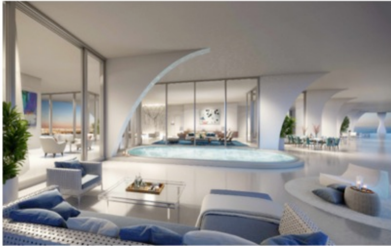
Penthouse at the Jade Signature.